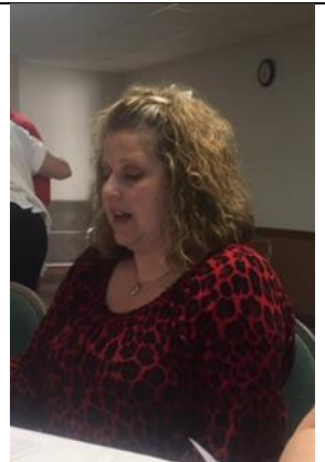
Program on the Founding of Delta Kappa Gamma