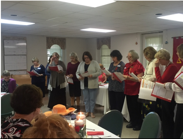
Installation of Officers