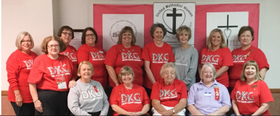
Always the center of Pi Chapter